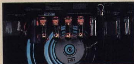
Valve Combo back panel showing four chassis-mounted SOVTEK EL-84 power tubes. Laney also uses super-quiet toroidal power transformers which are normally found only in high-end audiophile equipment.

While Laney has the excitement and great tone that the classic amps of the Sixties were famous for, it doesn't have the noise they were infamous for. So the VC30 isn't just a great playing experience...it's also the ultimate recording experience. Besides, if you were to go straight back to the 60's, you'd miss your 90's effects loops, switchable drive channels and large tank Accutronics reverbs which were not available on British amps in the 60's. But because the VC30 is fully loaded with new British amp technology you can travel back to the 60's with all the comforts of the 90's.